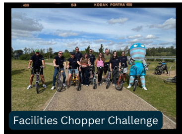
Facilities Chopper Challenge