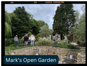
Mark's Open Garden