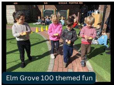
Elm Grove 100 themed fun