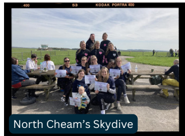
North Cheam's Skydive